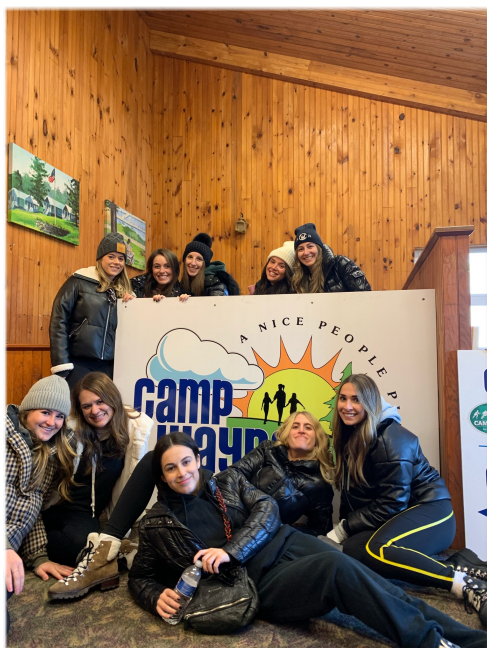
UGs '08 passing through Preston Park.