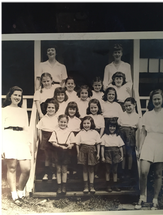
CWG - 1947