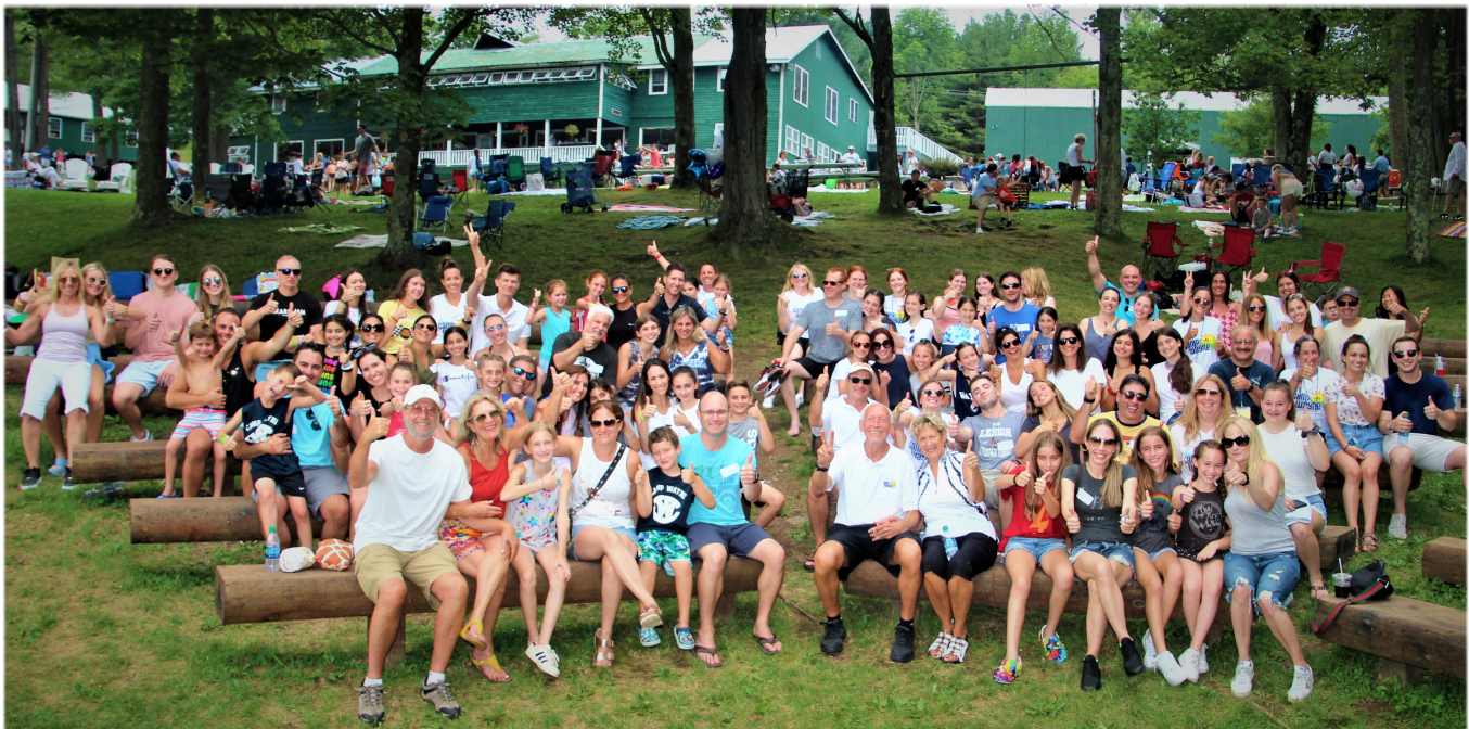
Alumni Photo from Visiting Day 2019