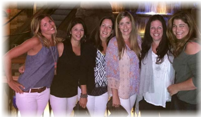
Mini reunion...couldn't make it in Sept so they had their own in August