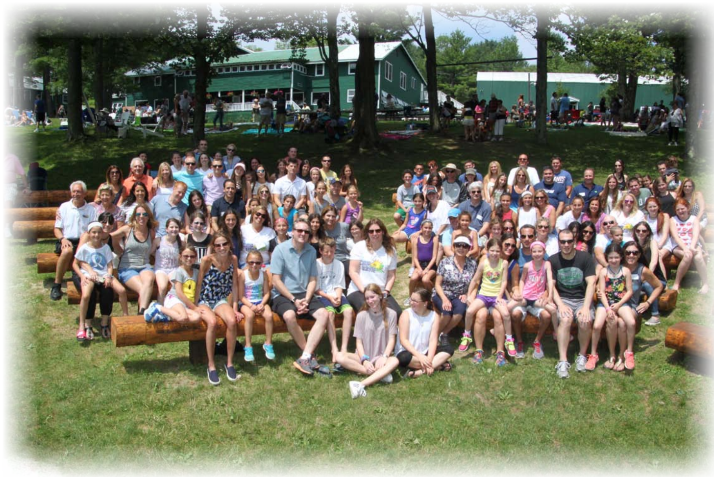
Alumni Picture from Visiting Day 2015

We couldn't be prouder to have been associated with such a wonderful program and more importantly with two such wonderful people. Like any summer camp, the memories and lessons learned by those children will live on long after their camp experience.