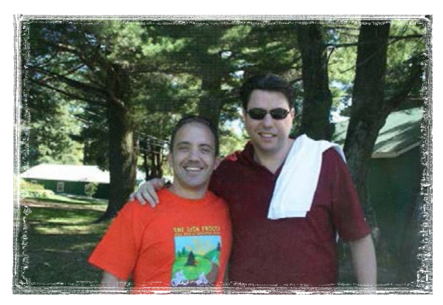
Gelf and House back at Wayne in 2010