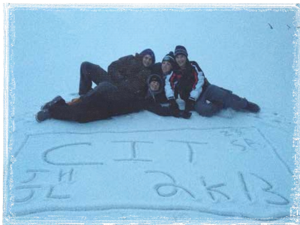
A few of our 2013 CITs on a very frozen lower lake in February.