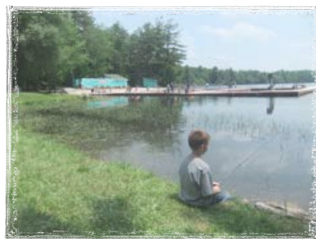
Hooked On Fishing Program at Wayne