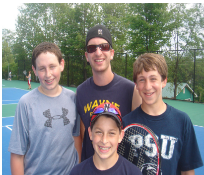
On the tennis courts

The next Alumni Reunion is scheduled for September 11 and 12, 2010!!