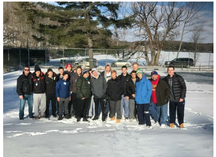
CIT Winter Retreat

At CWB, a new, air-conditioned fitness center will officially open its doors on June 24, the first day of camp. In addition to strength training exercises, campers of all ages will take part in SAQ (Speed, Agility, and Quickness) classes. The Woodshop got a full makeover and we're excited to see the new projects that the boys will be creating in 2017.