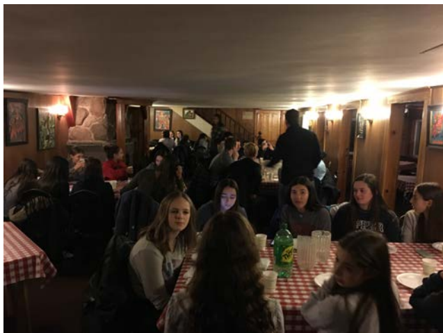
The CTTs taking over VC in January

At CWG, we are looking forward to our completely revamped and expanded high ropes course. Campers can now soar over the creek behind the Nook and get a bird's eye view of the waterfront! We've also continued with our multi-year project of renovating of all the bunk bathrooms including adding instant hot water heaters to those bunks. Camp won't be the same without those cold showers!