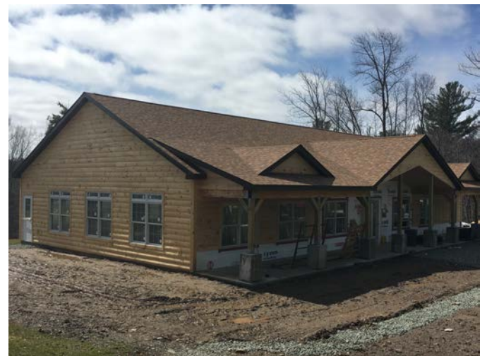
New Fitness Center at CWB in the works